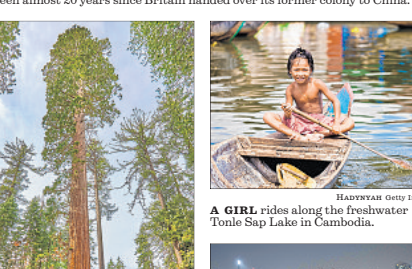
MARIPOSA GROVE of Giant Se-quoias will reopen in Yosemite.