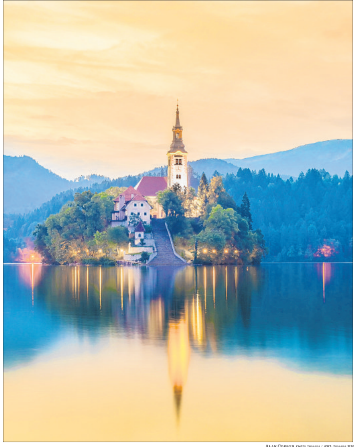
AND THE CHURCH of the Assumption, on an island in Lake Bled, is among a treasure-trove of scenery found in Slovenia.

christopher.reynolds@latimes.com Twitter:@mrcsreynolds