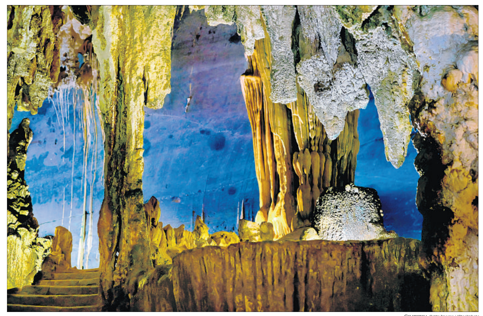
THE ENORMOUS CAVE SYSTEM at Phong Nha-Ke Bang National Park in Vietnam is about 400 million years old. The system is a UNESCO World Heritage site