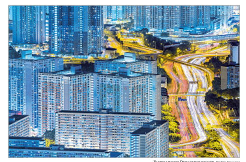
HONG KONG will have more than a dozen hotels opening during the new year. It has been almost 20 years since Britain handed over its former colony to China.